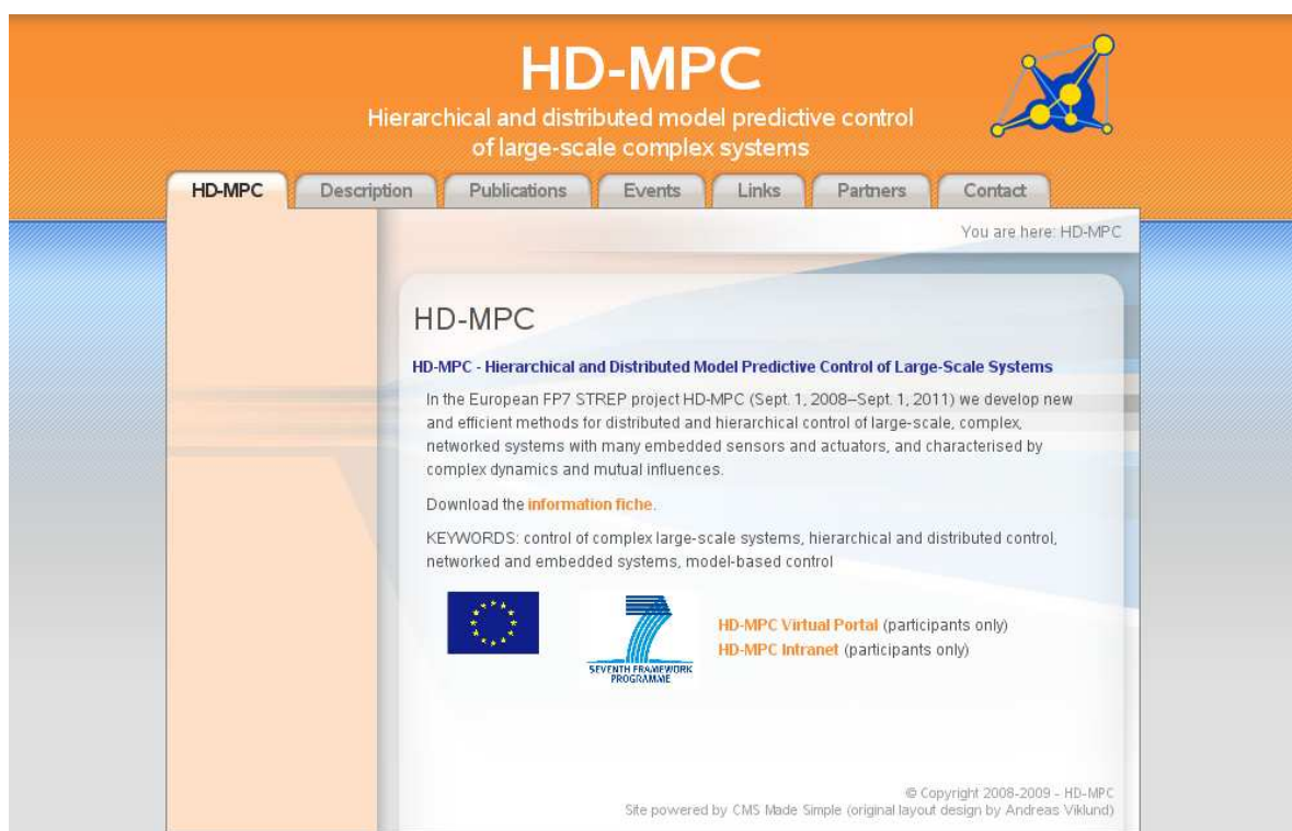
Figure 3.2: Screenshot of the HD-MPC web site (version 3) using the open-source content management system CMS Made Simple.